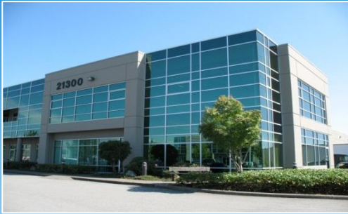
21300 Gordon Way