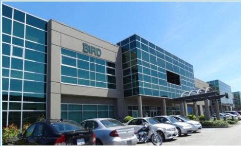
21320 Gordon Way

First Class Office Space Available from 1,200 Square Feet!